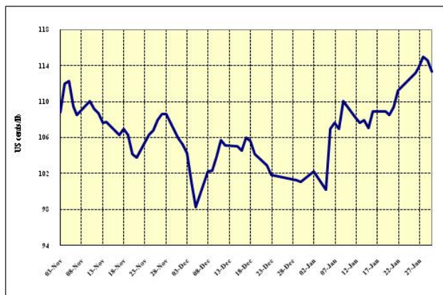
Graph 4: Daily indicator prices for Brazilian Naturals 3 November 2008 – 30 January 2009