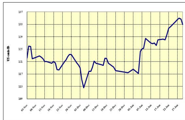
Graph 3: Daily indicator prices for Other Milds 3 November 2008 – 30 January 2009