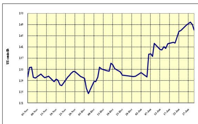
Graph 2: Daily indicator prices for Colombian Milds 3 November 2008 – 30 January 2009