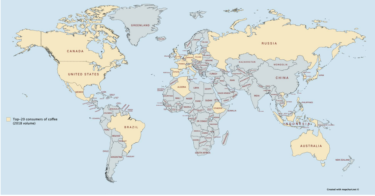
Figure 1: The sample includes the top-20 consumers of coffee (by 2018 volume)

The dataset contains annual observations of coffee consumption<sup>6</sup> obtained from the ICO Global Coffee Database, as well as economic and demographic indicators from the United Nations (UN) and World Bank, for the twenty most important coffee-consuming countries, which represent 71% of global demand (Figure 1). The dataset contains up to 578 annual, country-specific observations for each variable.